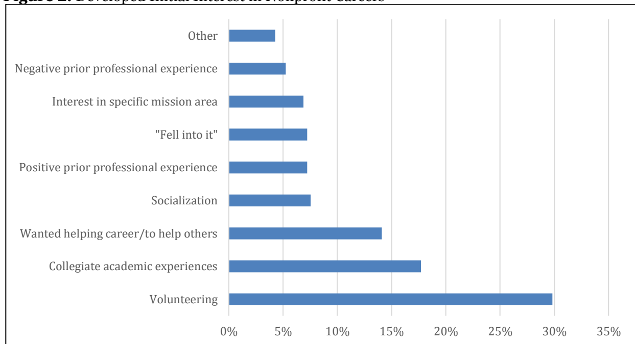
Figure 2. Developed Initial Interest in Nonprofit Careers

Note: This figure shows coded qualitative responses that describe how respondents initially became interested in nonprofit careers.